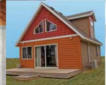
CLEAN COMFORTABLE AIR CONDITIONED CABINS