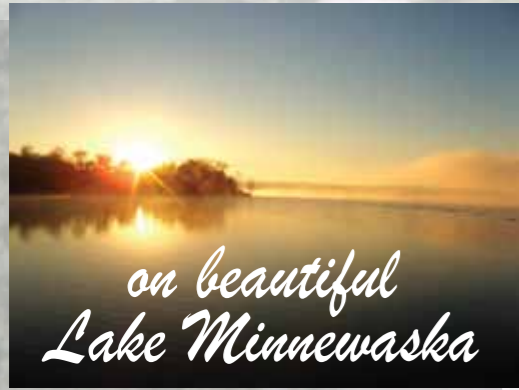
on beautiful Lake Minnewaska

We Welcome you to our Four-Season Resort!